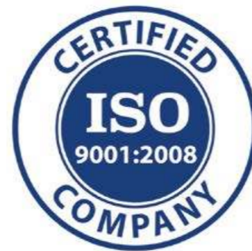
Quality assurance of ISO 9001:2008 standard