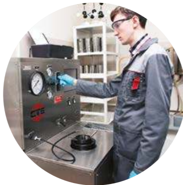
Modern equipment for the most up-to-date research