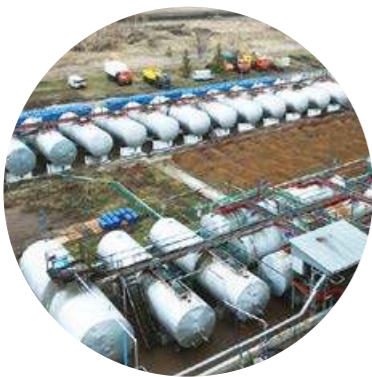
Wide range of chemicals